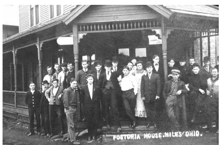
Many skilled workers stayed at the Fostoria(Later to become the Allison Hotel, then the Antler Hotel).

Afire in October 1904 caused by a faulty kiln in the decorating room, caused $10,000 damage. But by early November, some 50 employees in the decorating department were back to work and full operations resumed shortly afterwards. By 1906, this pottery had expanded its facilities to include a large one-story modeling shop and a two-story building to house the decorating department. There are apparently no records as to the number of kilns, but photographs indicate there were probably at least six. Only the latest and most improved machinery was used and the highest skilled labor employed in producing good quality earthenware. Most of the raw materials used by Bradshaw were imported and only the best that could be purchased was used on their production line. The company was progressing remarkably well and was recognized widely as a valuable asset to the town of Niles. However, by 1910, Bradshaw was in receivership.