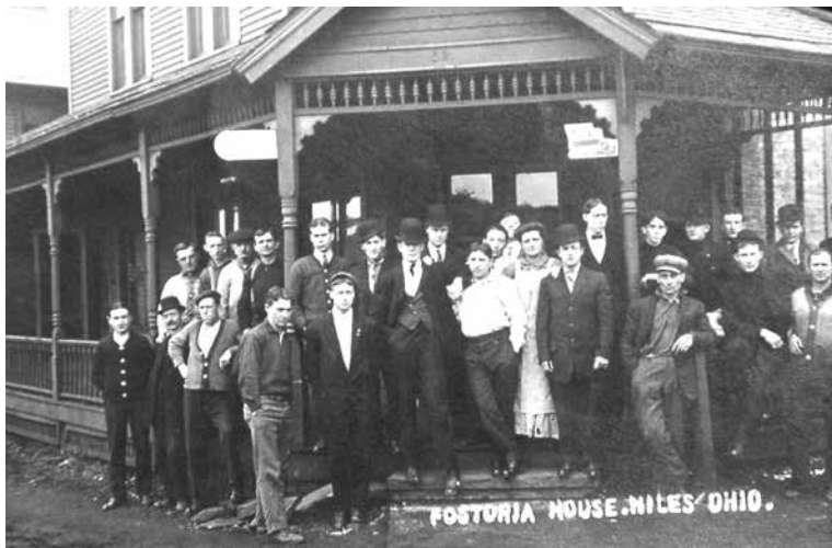
Many skilled workers stayed at the Fostoria (Later to become the Allison Hotel, then the Antler Hotel).

A fire in October 1904 caused by a faulty kiln in the decorating room, caused $10,000 damage. But by early November, some 50 employees in the decorating department were back to work and full operations resumed shortly afterwards. By 1906, this pottery had expanded its facilities to include a large one-story modeling shop and a two-story building to house the decorating department. There are apparently no records as to the number of kilns, but photographs indicate there were probably at least six. Only the latest and most improved machinery was used and the highest skilled labor employed in producing good quality earthenware. Most of the raw materials used by Bradshaw were imported and only the best that could be purchased was used on their production line. The company was progressing remarkably well and was recognized widely as a valuable asset to the town of Niles. However, by 1910, Bradshaw was in receivership.